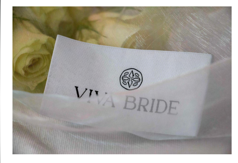
Weavabel customer case studies

See how Weavabel has helped brands like yours with their branded trims and packaging, and how we can help you to become more sustainable.