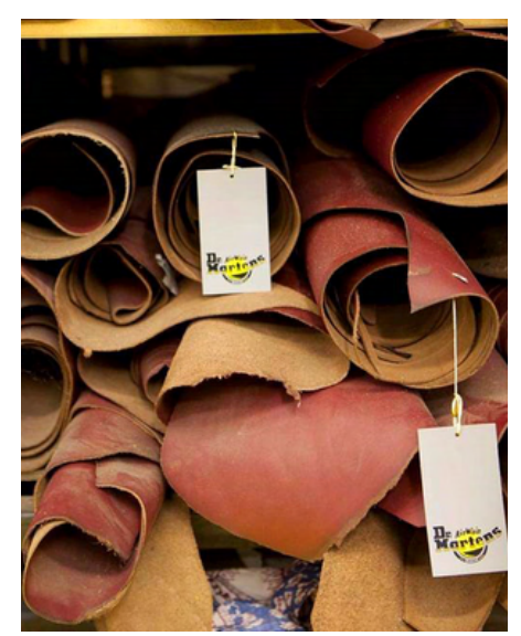
See the collection